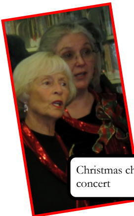
Christmas choral concert

All the light that we cannot see by Anthony Doerr