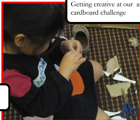
Getting creative at our annual cardboard challenge