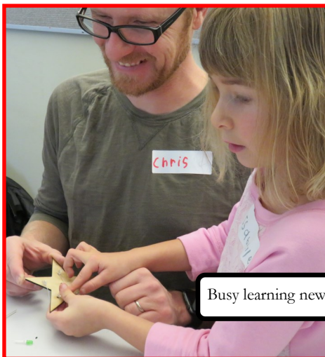
Busy learning new skills