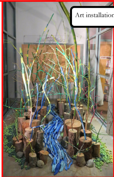
Art installation in the Library